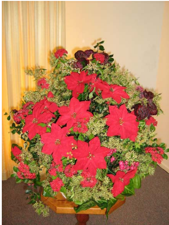
(Floral Arrangement Main Altar at the Temple in Maleny)